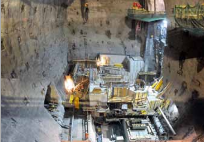
Building site Limberg II