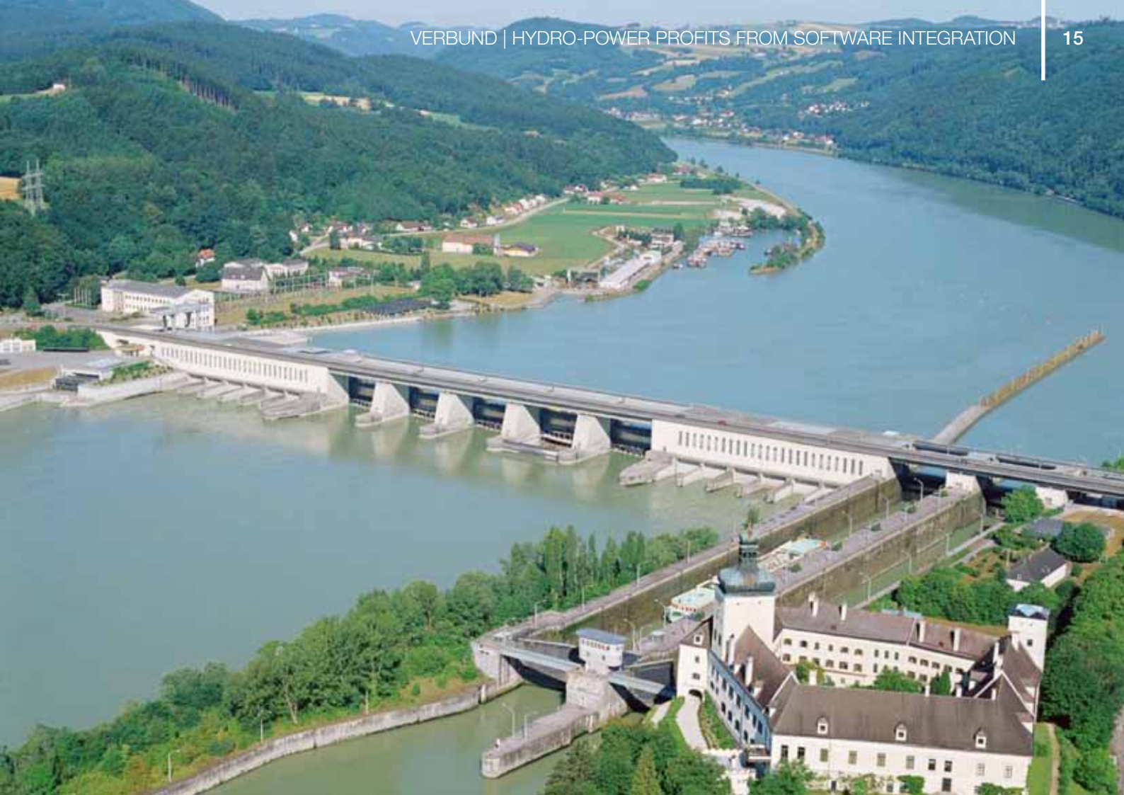
Danubian power plant Ybbs-Persenbeug

cated in a separate layer on top of the original drawing. Both the drawing and the layer make up the most current release of a plan.