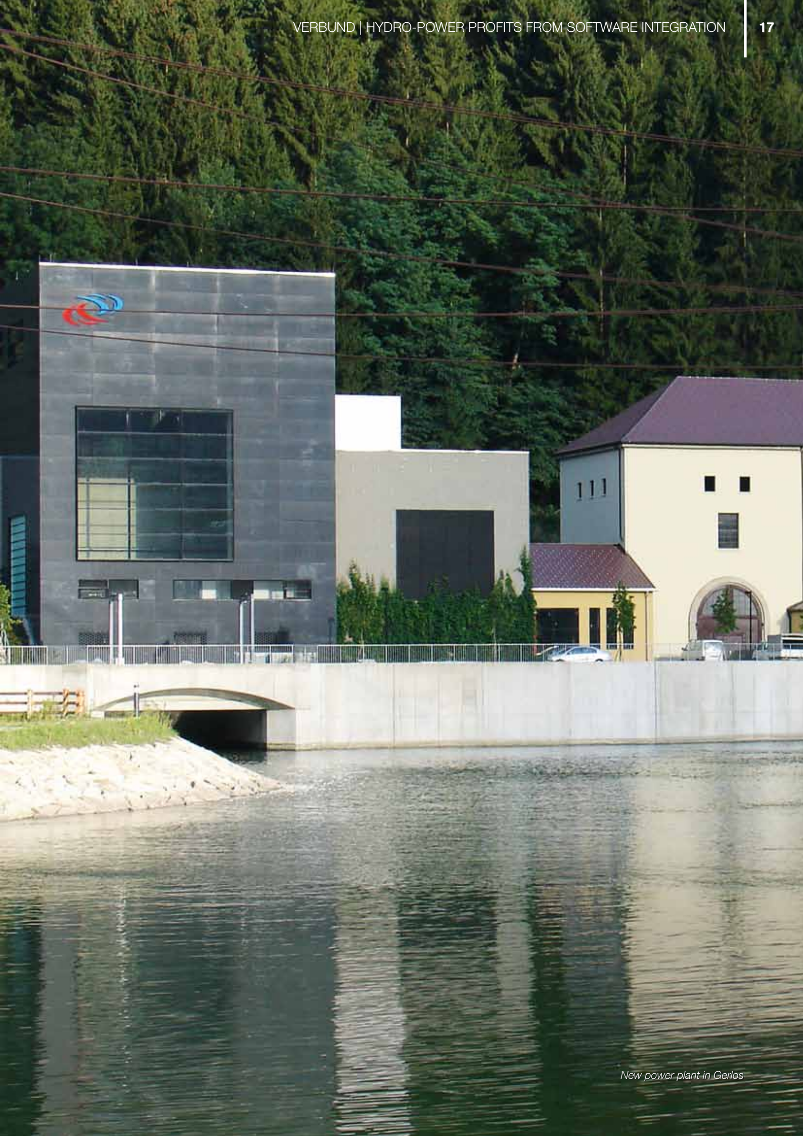
New power plant in Gerlos